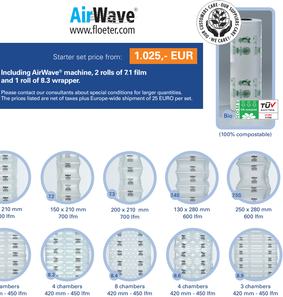
420 mm - 450 lfm

FLÖTER Verpackungs-Service GmbH Robert-Bosch-Strasse 17 D-71701 Schwieberdingen E-Mail: info@floeter.com Telefon +49 (0) 71 50 / 9 23 96-0 Telefax +49 (0) 71 50 / 9 23 96-80